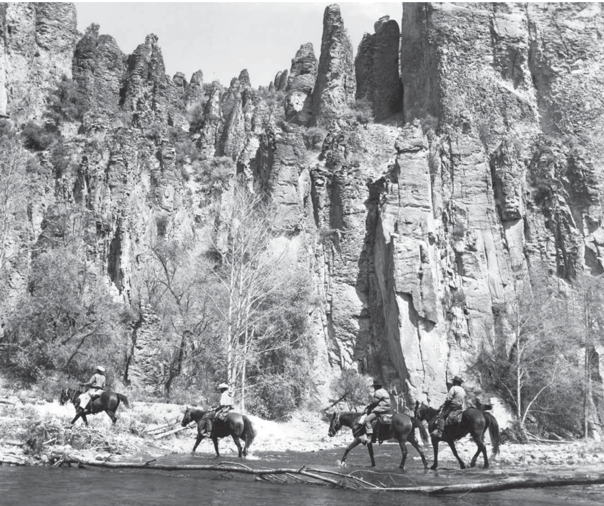
Trail riders cross the upper Gila River in an area known as the "Garden of the Gods." 1974.

The Quarterly Publication of the Silver City Museum Society