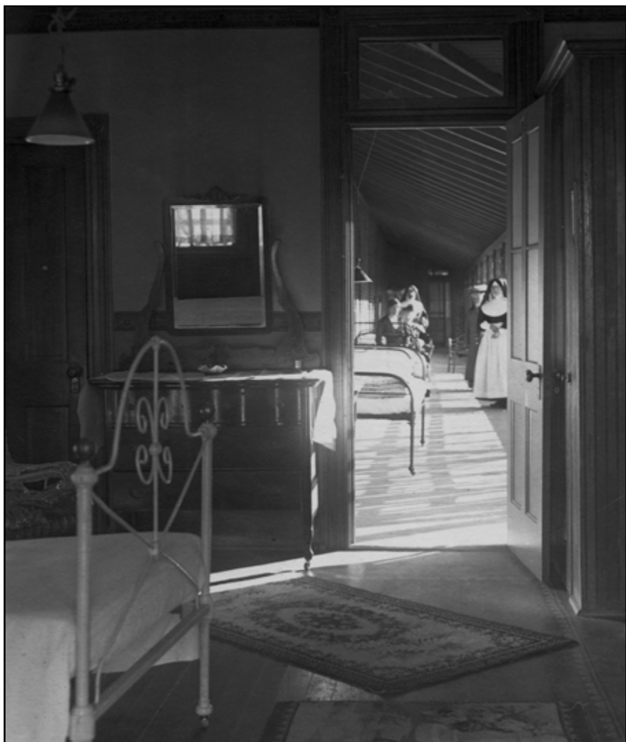
A long corridor at St. Joseph's Sanatorium, with nuns standing watchfully in a doorway circa 1920. This institution, located off Market Street, was previously known as Sisters Hospital, reflecting its roots in faith-based health care.