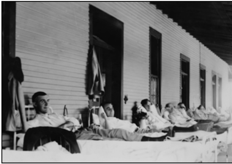
Patients rest in their cots on the sleeping porch at Fort Bayard Military Hospital, circa 1920. This image captures a common treatment for tuberculosis at the time, which emphasized exposure to outdoor air as a crucial element of recovery.