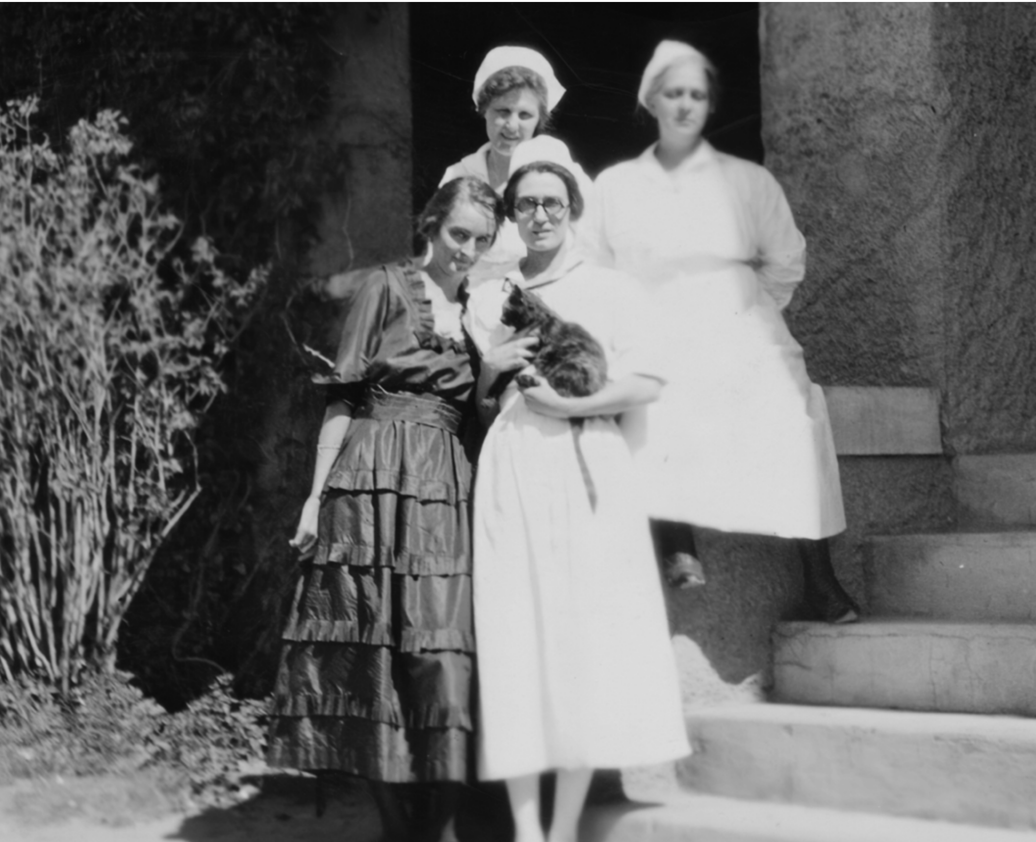
Four women, including three in nurse's uniforms, share a lighthearted moment with a cat in front of the historic Fort Bayard Military Hospital circa 1920. The image captures a glimpse of the camaraderie and dedication of the medical staff who served at this historical site.

The Quarterly Publication of the Silver City Museum Society