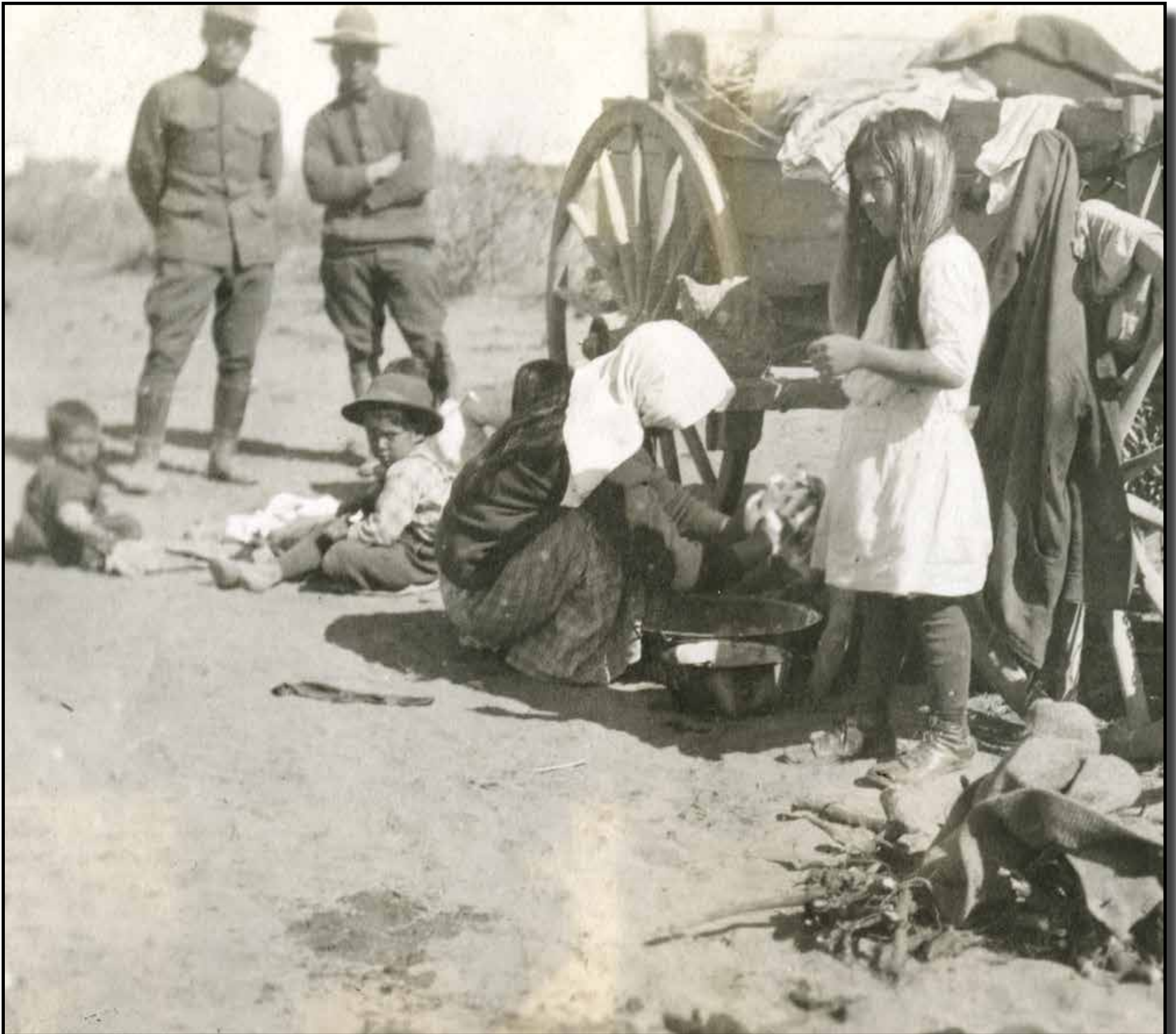
"Mexican refugees following the U.S. Army wagon train during General John "Black Jack" Pershing's "Punitive Expedition" against Pancho Villa. The photos were taken outside of Deming, New Mexico [circa 1916]."

The Quarterly Publication of the Silver City Museum Society